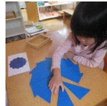
Penny is working with the Blue Triangles.