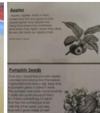
We have been learning & talking about apples & pumpkins.