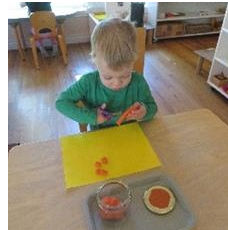
Adam is practicing cutting play doh.