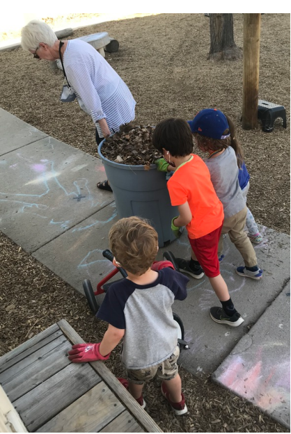
Teamwork! Caring for our environment. Baby chicks! Couldn't be cuter:)