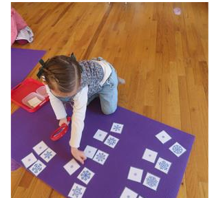
Edith is matching big and small snowflakes by using a magnifying glass.