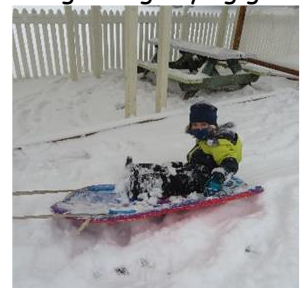
Finally some snowy fun on the playground.