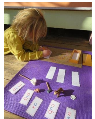
Ayla; Object box with labels